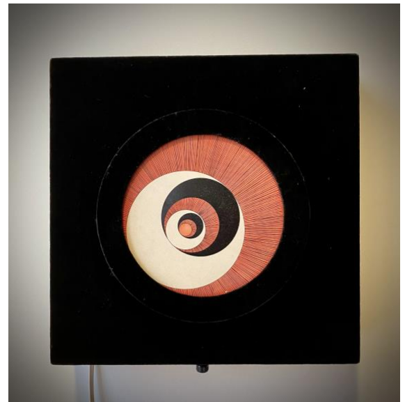
Marcel Duchamp was the pioneer kinetic artist. He is often referred to as the greatest artist of the 20 th century. This work in The Butler’s Bermant Collection titled “Rotorelief” is one of his first motorized pieces created in the early 20 th century.

Installation of these Kinetic art pieces is currently ongoing and is expected to be complete this summer. The works will be seen in galleries throughout The Butler’s Beecher Center, in the Bermant Gallery’s “Light and Sound” exhibit, and on the grounds outdoors. Visitors can expect intermittent closures of galleries and sections of Beecher Center during this ongoing installation process but will not have to wait until summer when it is fully completed to view some of the artworks.